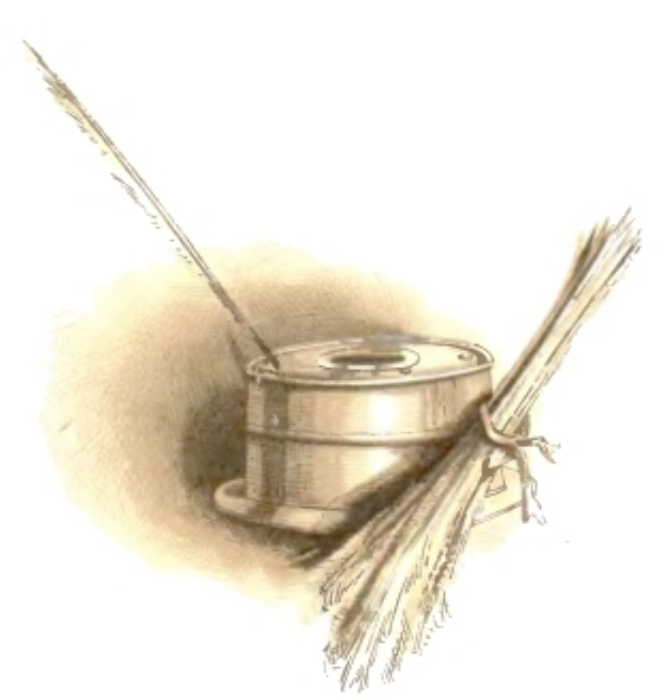
© 2001, Global Language Resources, Inc.